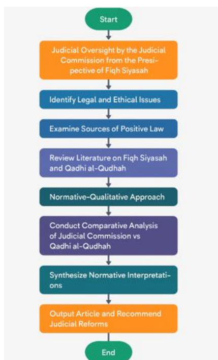
Figure 1. Judicial Oversight Research Flow