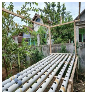
Figure 5. A hydroponic system designed and maintained by students to practice measuring water volume and growing area. Captured by the research team during project activities; with the consent of students and teachers.