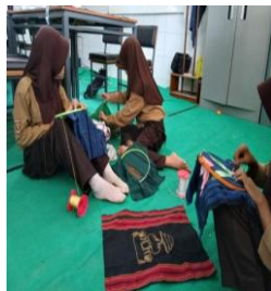
Figure 11. Creating plant pots out of plastic bottles, captured by math teachers during Grade 4 project-based learning; photo documentation verified through lesson plan notes and student consent forms.