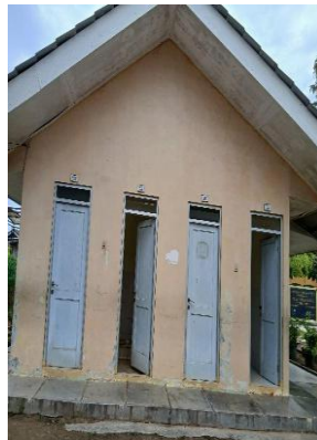
Figure 7. Student toilet facilities are well maintained to support a clean and healthy learning environment. Images documented by the research team during infrastructure observations; verified by the school administration.