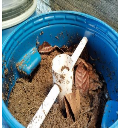
Figure 3. Student-managed compost areas are used for hands-on measurement and waste management activities in math classrooms. Student participation is documented with parental and school consent.

compost, or designing a garden using plastic bottles. These scenarios help students connect mathematical ideas to real-life situations, making concepts such as unit conversion and geometry easier to understand. For example, they calculate the water requirements for a hydroponic system and plan the planting area by applying a measurement formula. Through this practice, they not only develop their cognitive abilities but also foster a sense of responsibility towards environmental sustainability, as reflected in the fact that around 85% of students show strong environmental awareness, with an average attitude score of 4.2 out of 5 (Batiibwe, 2020; Sari et al., 2022).