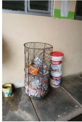
Figure 9. The waste sorting area is used to support recycling activities and numeracy skills in counting recyclable materials. Documented by researchers during school environmental audits; consent is obtained from the teachers and students involved.