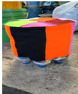
Figure 12. Building ecobricks, photographed by Adiwiyata coordinators during sustainability workshops; this activity is approved as part of the school's official environmental program and ethically validated.