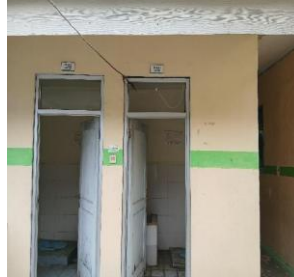
Figure 6. Teacher toilet facilities that reflect school hygiene standards and environmental sustainability practices.

Adequate facilities and infrastructure, such as clean toilets, healthy cafeterias, inorganic waste separation areas, and hydroponic support systems, strengthen the implementation of sustainability programs. The availability of these facilities allows project-based learning to be maintained across grade levels and subject areas. Students are taught to apply numerical skills directly, such as calculating the number of plastic bottles needed for ecobricks or determining the crop of vegetables sold to the community. These real-life numerical applications not only reinforce mathematical concepts but also expose students to the economic and social dimensions of sustainability, including recycling practices, efficient resource management, and understanding the product value chain (Bramwell-Lalor et al., 2020; Balseca Inca., 2023).