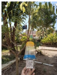
Figure 13. Using QR codes in the school garden, picked up by ICT teachers during integrated science-mathematics sessions; supervised by the principal and reported in the school's ESD (Education for Sustainable Development) annual report.

Each activity develops concrete math skills, such as estimation, spatial reasoning, and basic budgeting, while building ecological awareness.