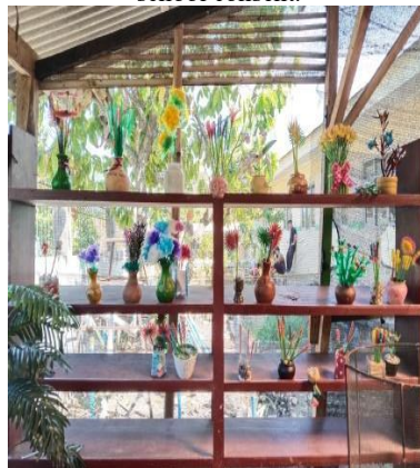
Figure 4. Crafts made by students from recycled plastic bottles to apply the concepts of geometry and recycling. Documented by the researcher during project-based learning sessions; ethical approval obtained from the principal.