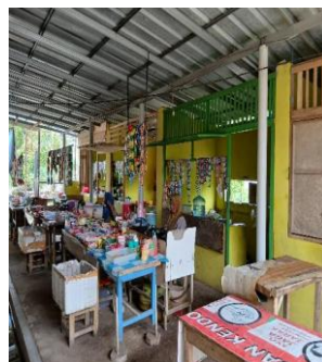
Figure 8. Healthy cafeterias promote nutritious food choices and waste reduction among students. Photos taken during school lunch break observations; Arrested with permission from staff and students.